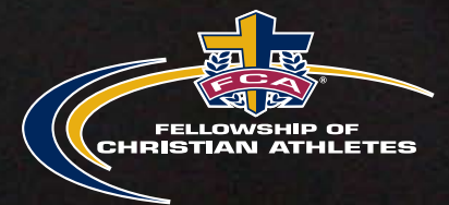
FCA Black Mountain Camp, Shaun Alexander, Seattle Seahawks